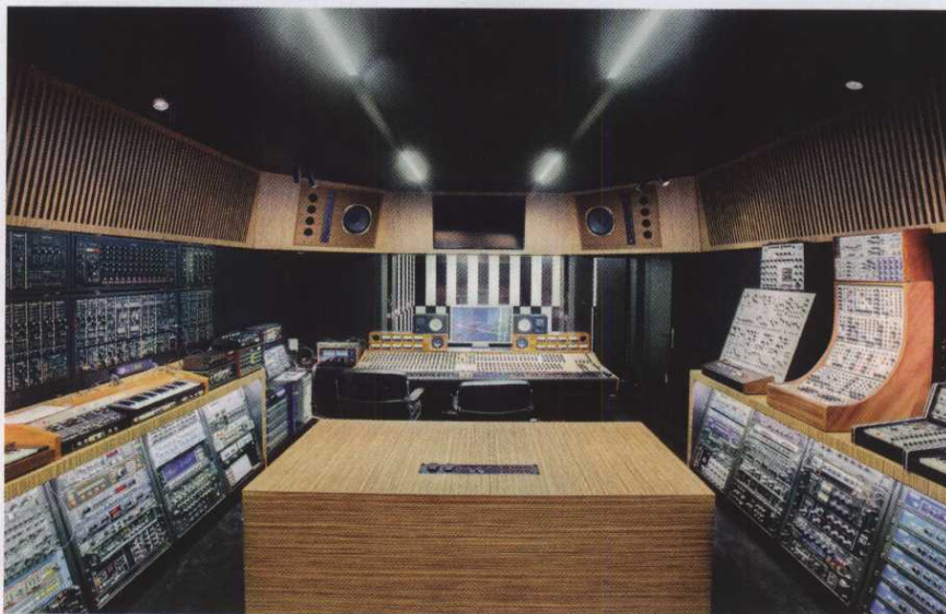
THE RECORDING ROOM, WITH ITS 1969 CADAC MIXING DESK, AT THE GLENN SESTIG-DESIGNED STUDIOS OF BELGIAN ELECTRO WHIZ-KIDS 2MANYDJS. SEE PAGE 090