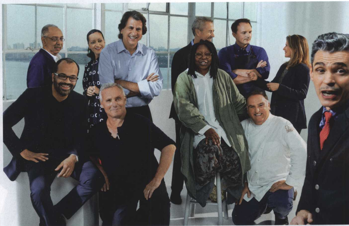
D DAVID ROCKWELL'S GROUP HUG: THE NEW YORK ARCHITECT CELEBRATES 30 YEARS IN THE BUSINESS WITH LONGSTANDING FRIENDS, INCLUDING WHOOP! GOLDBERG AND IAN SCHRAGER. SEE PAGE 072