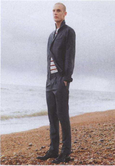
↑ SHIRT, €525; TROUSERS, €425, BOTH BY FAÇONNABLE. TOP, £175, BY SANDRO. SHOES, £780, BY DIOR HOMME. SEE PAGE 208