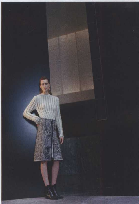
TOP, £690; SKIRT, £660; BOOTS, £800; EARRINGS, £510, ALL BY LOUIS VUITTON. SEE PAGE 206