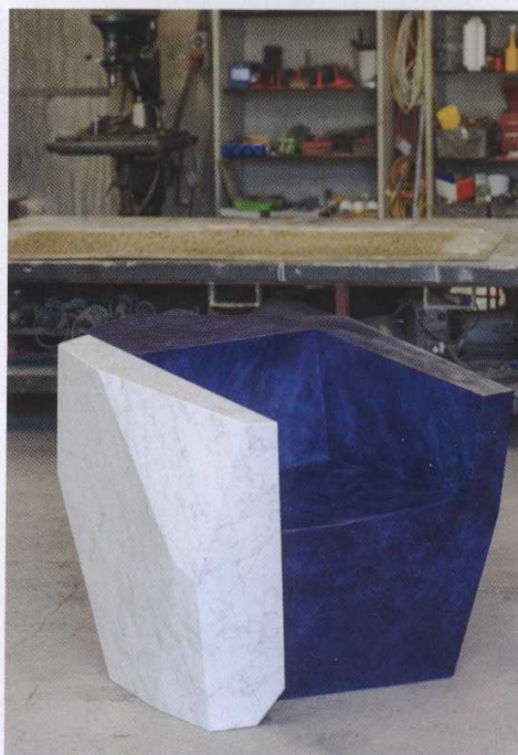
'ELEMENTAL SPLIT UNIT' CHAIR IN MARBLE AND BRONZE, BY DANIEL LIBESKIND, FOR DAVID GILL GALLERY. SEE PAGE 124

175 | Ellipse gloss A Patek Philippe classic shines again