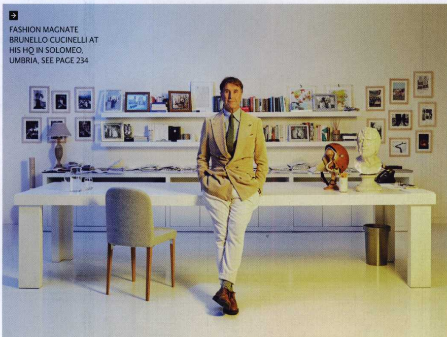
FASHION MAGNATE BRUNELLO CUCINELLI AT HIS HQ IN SOLOMEO, UMBRIA, SEE PAGE 234

211 | Heel spin The creative director bringing Parisian panache to a Chinese shoe brand