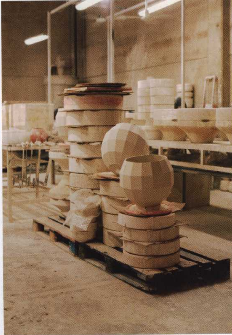
↑ MOULDS AT THE WORKSHOP OF SPANISH CERAMICS STUDIO APPARATU, SEE PAGE 106

232 | Spot light Take your seats – we're putting on a performance