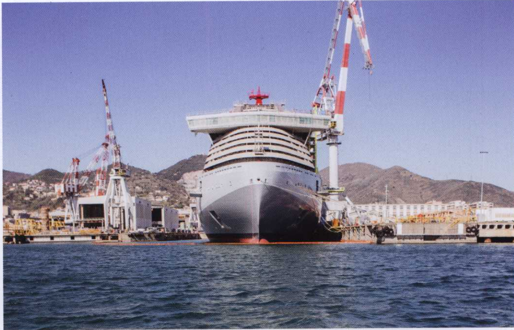
THE SCARLET LADY, THE FIRST CRUISE SHIP IN THE NEW VIRGIN VOYAGES FLEET, PAGE 084