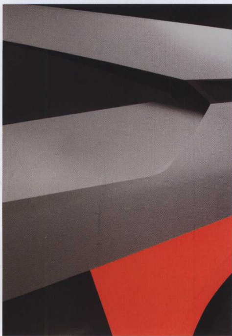
K KONZEPTFAHRZEUG 5, BY THOMAS DEMAND, ONE OF THE ARTIST'S TEASERS FOR THE UPCOMING BMW VISION M NEXT, SEE PAGE 188