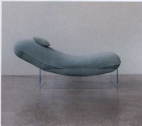
▲ 'COALESCE', BY STUDIO TRULY TRULY, PART OF THE UPCOMING 'KNIT! BY KVADRAT' EXHIBITION IN COPENHAGEN, SEE PAGE 094