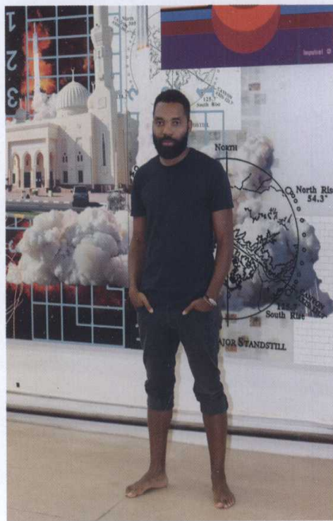
↑ ARTIST TAVARES STRACHAN IN FRONT OF THE AWAKENING , WHICH APPEARS IN HIS NEW LONDON SHOW, SEE PAGE 120

248 | Stockists What you want and where to get it