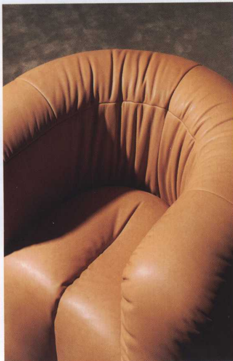
↑ THE RULE-BREAKINGLY BENDY FORM OF THE 'DS-707' LEATHER ARMCHAIR, BY PHILIPPE MALOUIN FOR DE SEDE, SEE PAGE 126