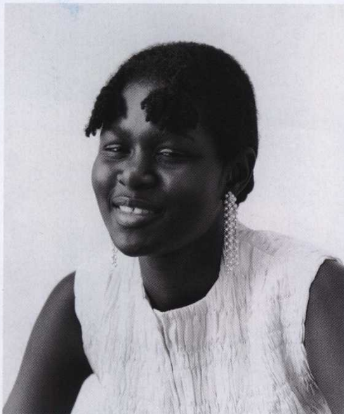
↑ TOP, £1,350, BY JIL SANDER BY LUCIE AND LUKE MEIER. EARRINGS, PRICE ON REQUEST, BY VAN CLEEF & ARPELS, SEE PAGE 174