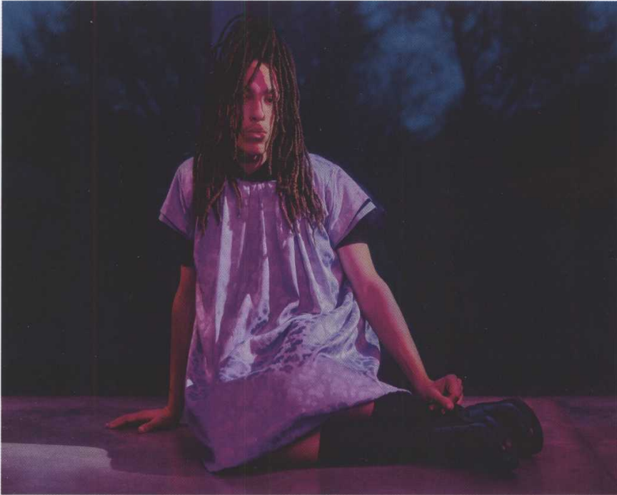
TUNIC, PRICE ON REQUEST; POLO SHIRT, £590, BOTH BY RAF SIMONS. SHOES, £1,055, BY JOHN LOBB. SOCKS, £35, BY PANTHERELLA, SEE PAGE 100