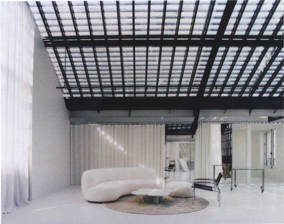
THE TOP-FLOOR EVENT SPACE AT LVMH MÉTIERS D'ART'S NEW HQ IN PARIS' 2ND ARRONDISSEMENT. SEE PAGE 060